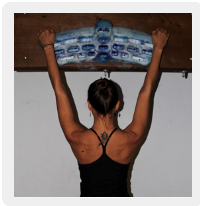
Figure 2: Hangboard training. The boards are usually made of resin and the hold's shapes simulate climbing holds.

Different grips and specific climbing movements affect the biomechanics of the wrist, forearm and elbow. Which when combined with repetitive micro injuries and the fact that the tendon takes a long time to regenerate can be a disastrous recipe and cause some issues. An example of injury due to the concomitance of inappropriate biomechanics and overuse is the "climber's elbow". Where there is a rupture, of variable size, in the musculotendinous junction of the brachialis muscle.